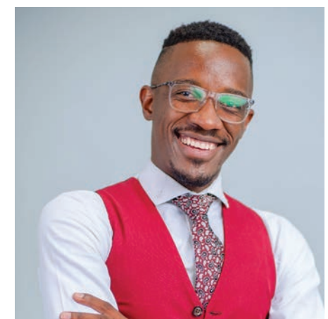
BAKANG PHUTHEGO BUSINESS WITH BK

The algorithm is not evil. It is indifferent. It does not care about your child's potential, creativity or humanity. It cares about how behaviour it can predict and patterns it can monetize. It is doing its job efficiently, invisibly, and constantly.