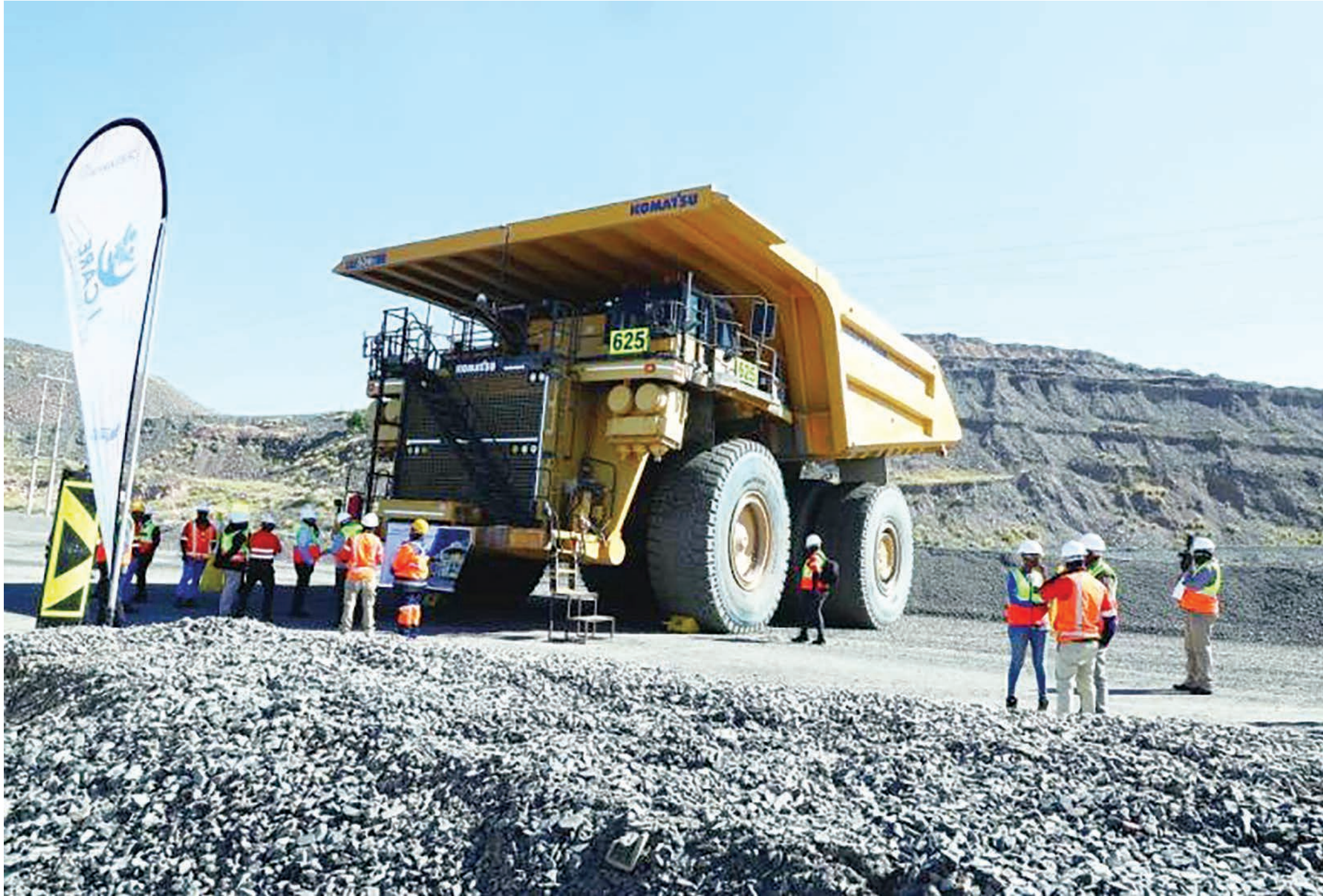
Debswana Diamond mine

Siwawa said the USA is a big market for Botswana rough diamonds and the higher tariffs rate would reduce Botswana's exporting