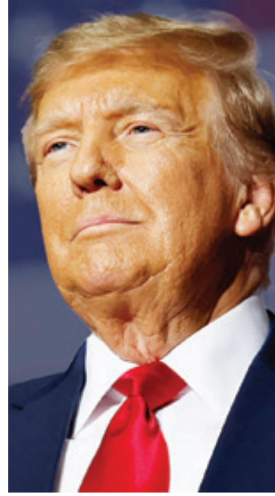
labelled her a communist because of that. Not true.

During the U.S. 2024 election campaign, he criticised Kamala Harris's (the Democrat presidential candidate) price control policy and