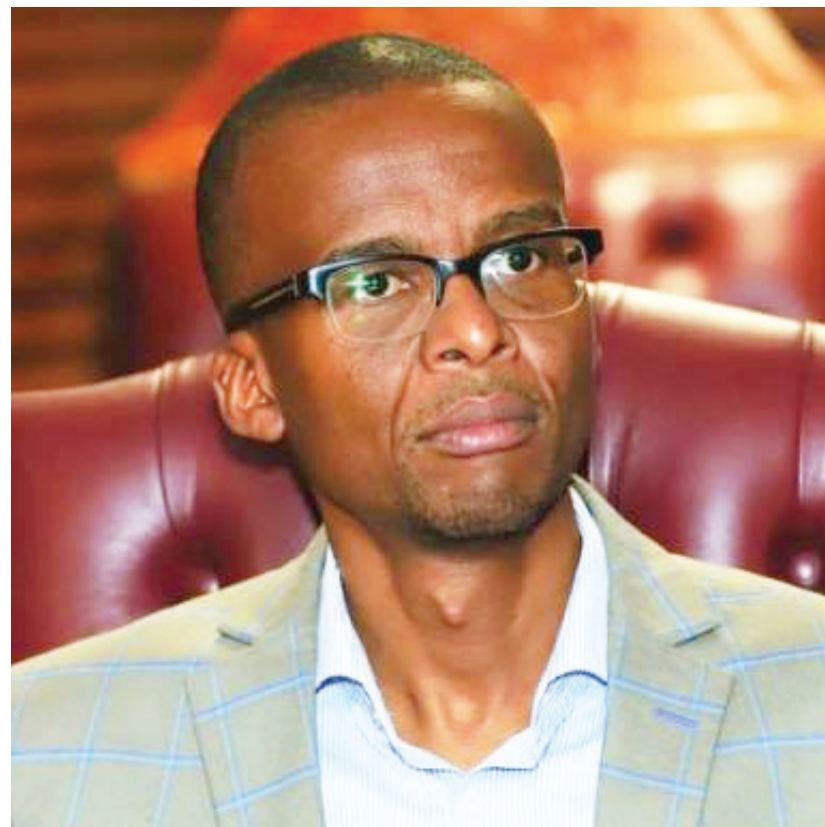
Botswana Vice President Ndaba Gaolathe

B OTSWANA'S GOVERNMENT said it's optimistic that Anglo American will find a buyer for its diamond unit De Beers this year.