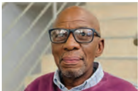
ADAM PHETLHE ON SUNDAY!

THE UMBRELLA FOR DEMOCRATIC Change (UDC) will feature prominently in the annals of history as the first political movement to break the dominance of the Botswana Democratic Party (BDP). The ascendancy of the UDC was eminent given the total disconnect between the BDP and the citizenry over a plethora of failures particularly on the socio-economic front where deep pain was felt. One is not oblivious to other developmental failures. Given the huge expectations created by the euphoria of electoral victory and the overpromises by the UDC, the focus is firmly on government for prompt delivery.