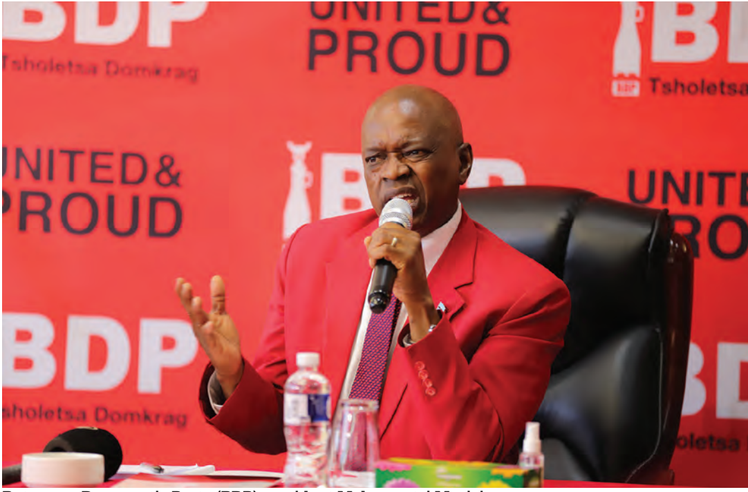
Botswana Democratic Party (BDP) president Mokgweetsi Masisi

“Trust in leadership is critical for transformative, collective action and communication with transparency in times of uncertainties. He should have prepared and planned for the press conference as well as adaptive to the changing political dynamics,” said Dr