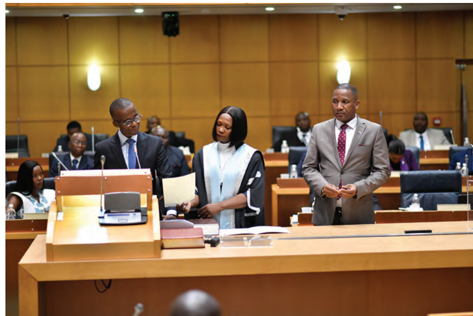
President Boko [R] with Vice President Ndaba Gaolathe

The President has been criticised for not delivering the P 1,800 elections promise for the elderly. And I think the criticism is fair particularly that he was adamant that come end of November 2024, the elderly would receive the money. Be that as it may,