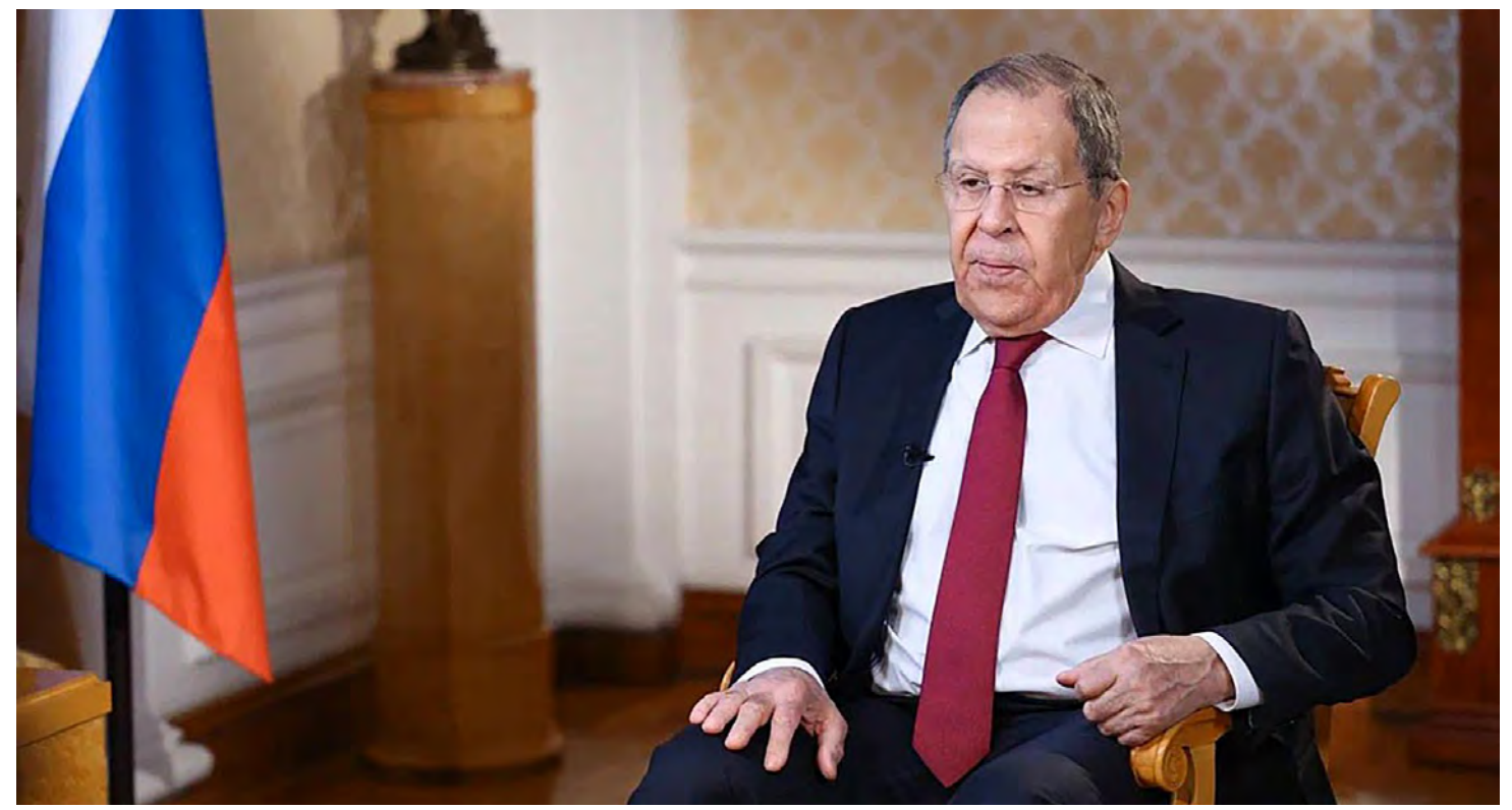
Foreign Minister Sergey Lavrov

That said, we do not have any illusions. The so-called Biden partners have caused a very deep chasm in our