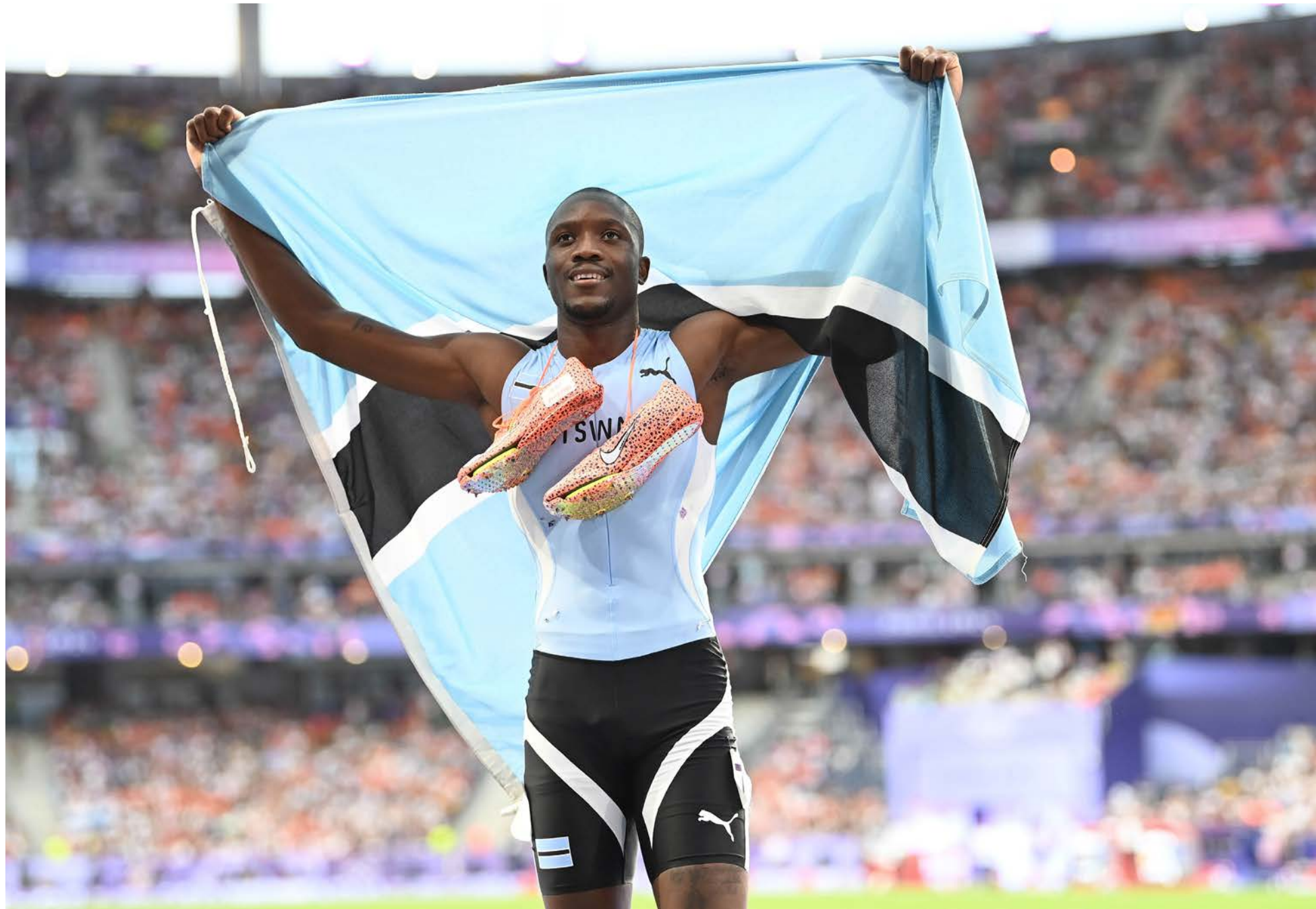
HISTORIC: Botswana's own Letsile Schoolboy Tebogo became the first ever African athlete to win gold in the 200m sprint at the Paris 2024 Olympic Games.