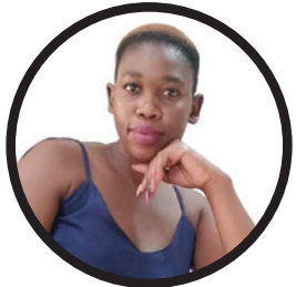
LAGAGO TAMOCHA* EDUCATING THE 21 ST CENTURY LEARNER

O UTCOME-BASED Education (OBE) is a student-centered learning philosophy that bases each part of an educational system around goals, or outcomes. By the end of the educational experience, each student should have achieved these goals. Unlike traditional education models that emphasize the means, OBE focuses on the end results. This educational approach has gained traction globally, prompting a re-evaluation of assessment procedures to ensure they align with the principles of OBE.