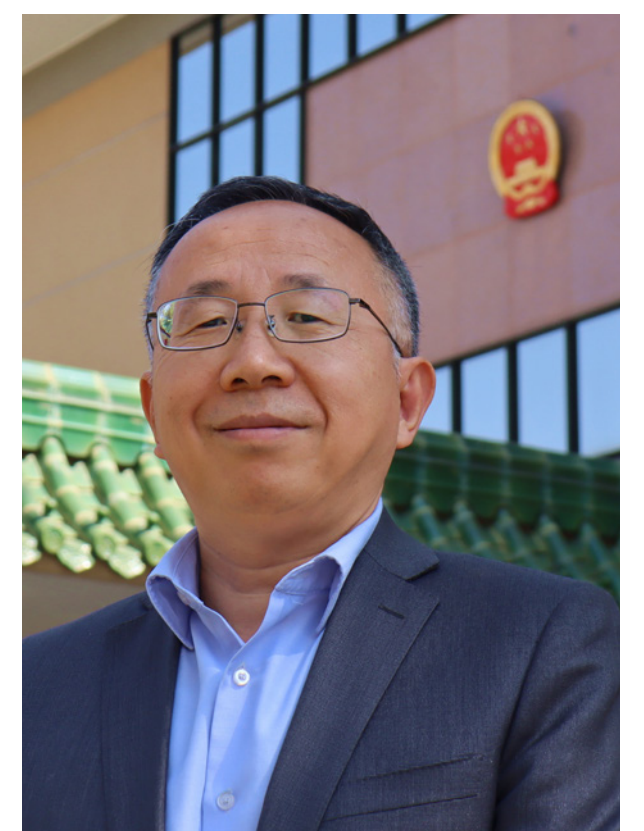
Ambassador H.E. Fan Yong, Ambassador Extraordinary and Plenipotentiary of The People's Republic of China to the Republic of Botswana

China's endeavor of further deepening reform comprehensively to advance Chinese modernization will create new opportunities for China-Botswana friendly cooperation in the new era. Botswana is an important country in Africa, and has always been a true friend and good brother of China. Since the establishment of diplomatic relations in 1975, China and Botswana have expanded cooperation in agriculture, health care, education, infrastructure, digital construction and other fields. In 2023, the total trade