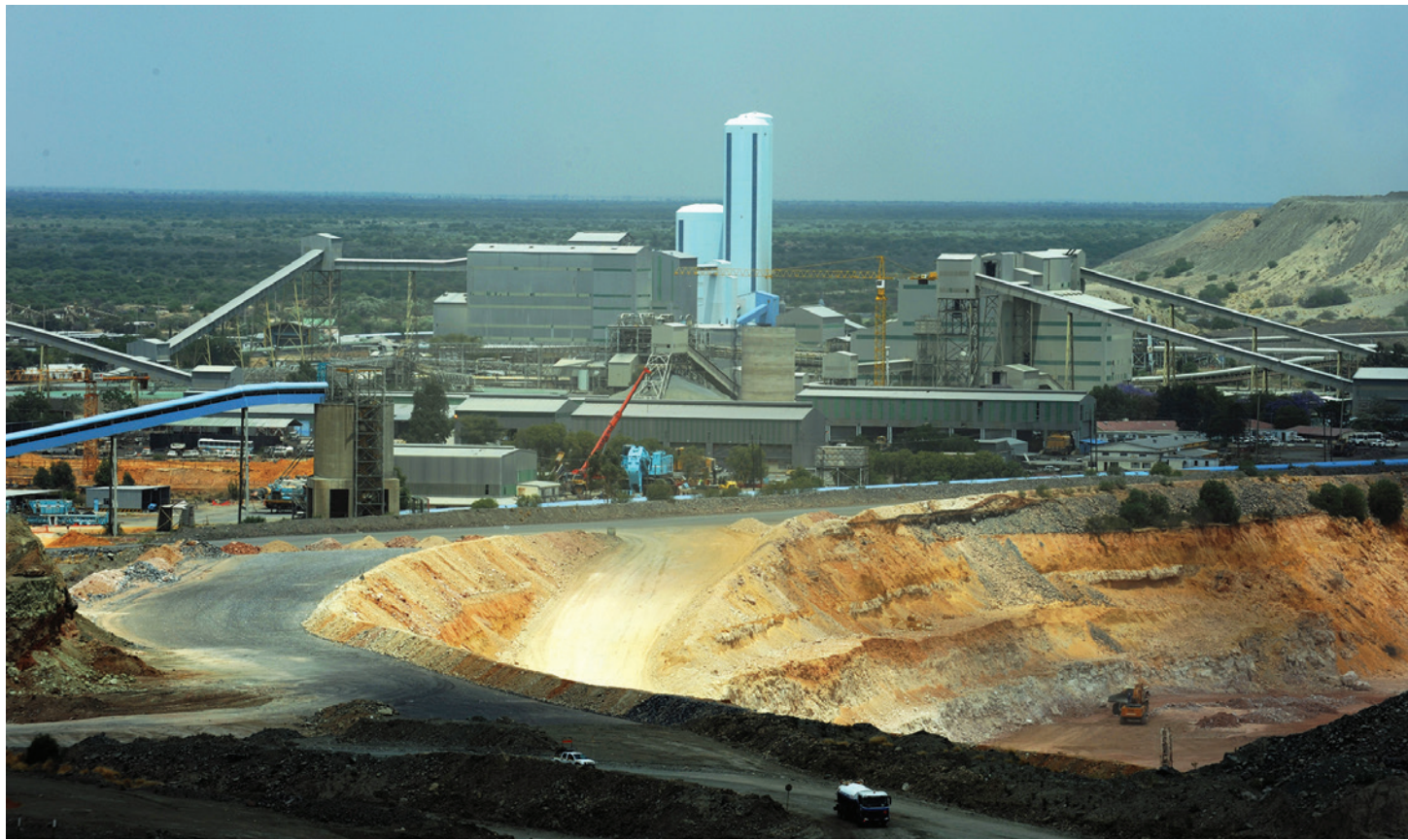
JWANENG MINE: Diamonds are the backbone of Botswana's economy