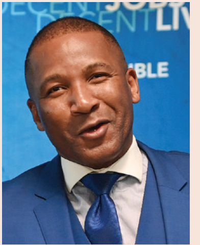
UDC President, Duma Boko