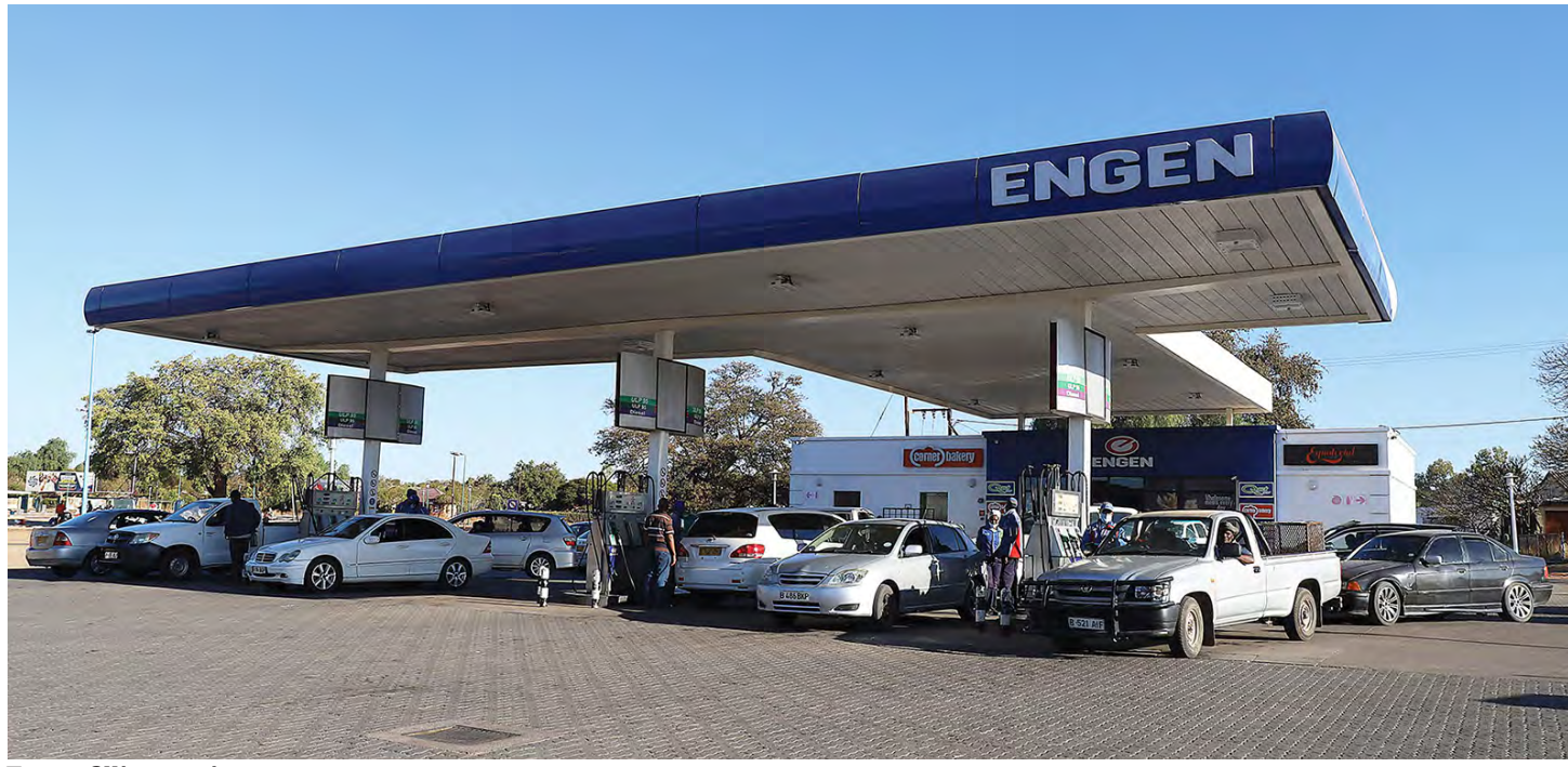
Engen filling station

All those that have been affected will be assisted in accordance with the Engen