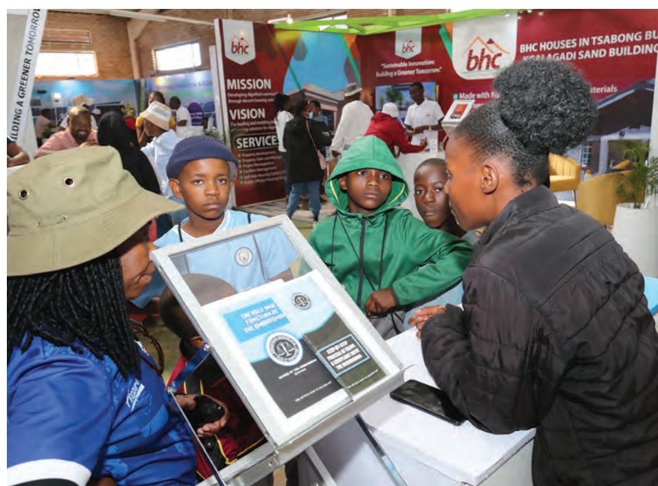
Exhibitors at the fair

Distinguished guests, it is vital to note that sustainable innovation is not just about developing new technologies or products; it is about fundamentally reimagining our systems, processes, and mind-sets. Mindset change as presented by our President, His Excellency, Dr. Mokgweetsi E.K Masisi, requires us to challenge conventional