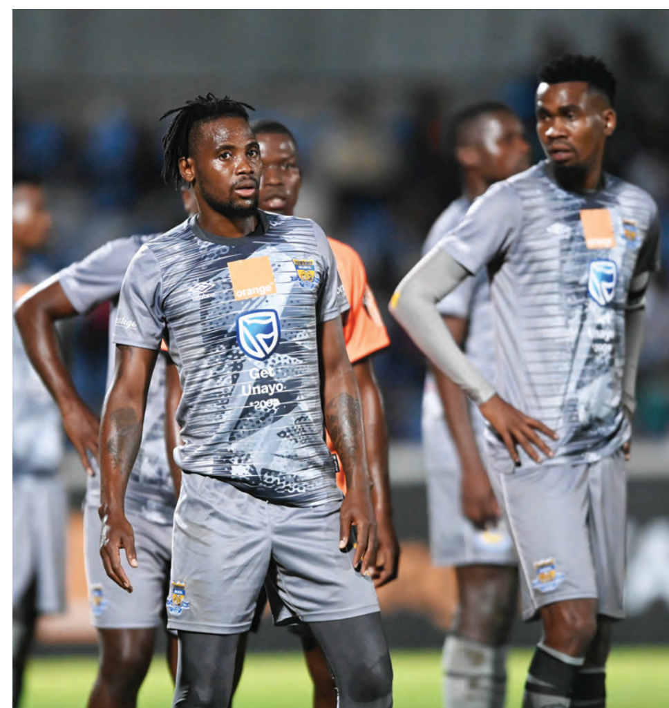
Township Rollers team