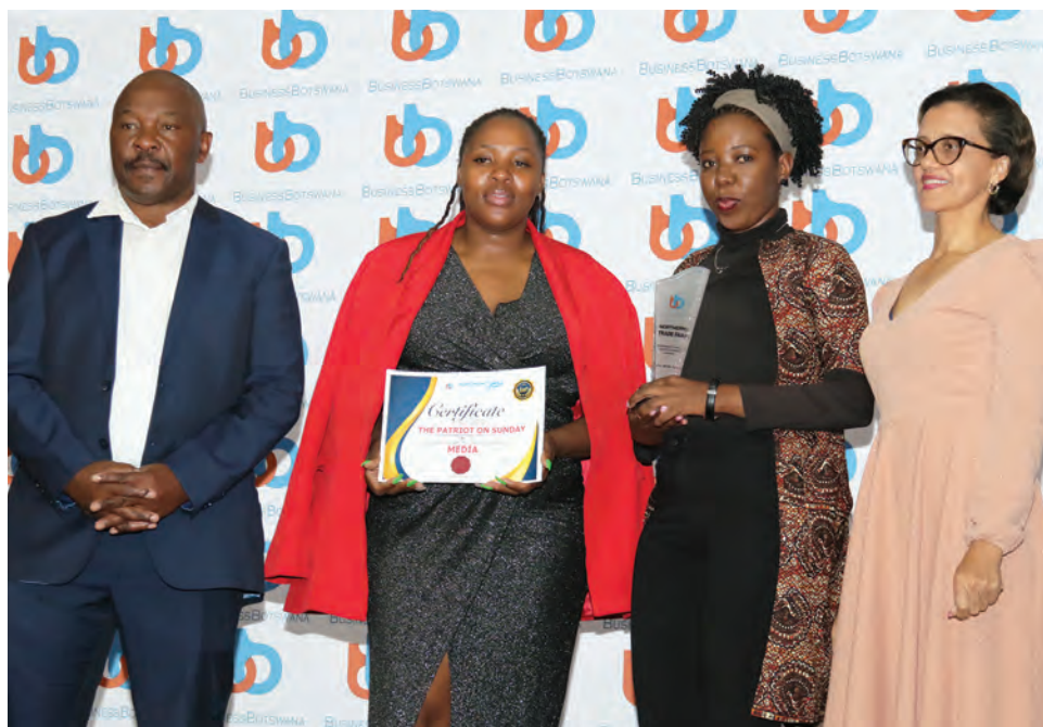
The Patriot Media group won the Top Award at the 28th Northern trade fair ahead of other media houses that exhibited

Of the 2500 businesses we represent, 85% are SMEs, and therefore its growth and capacitation remain a key priority. This is a testament to our deliberate efforts through the various programmes we have including the Support to the Economic Diversification Project. Funded by the African Development Bank (AfDB), the project is aimed at fostering economic diversification. Since its launch, we have conducted countrywide capacitation programmes for over 300 businesses in the horticulture, business development, and tourism sectors. This training was conducted in partnership with the Botswana Horticulture Council (BoHoCo), and The Hospitality and Tourism Association of Botswana (HATAB). It would be a remiss of me not to inform you that the development of our new 5-year strategic plan is almost complete and aimed at fostering long-term economic development. This blueprint will be geared towards nurturing an inward-looking,