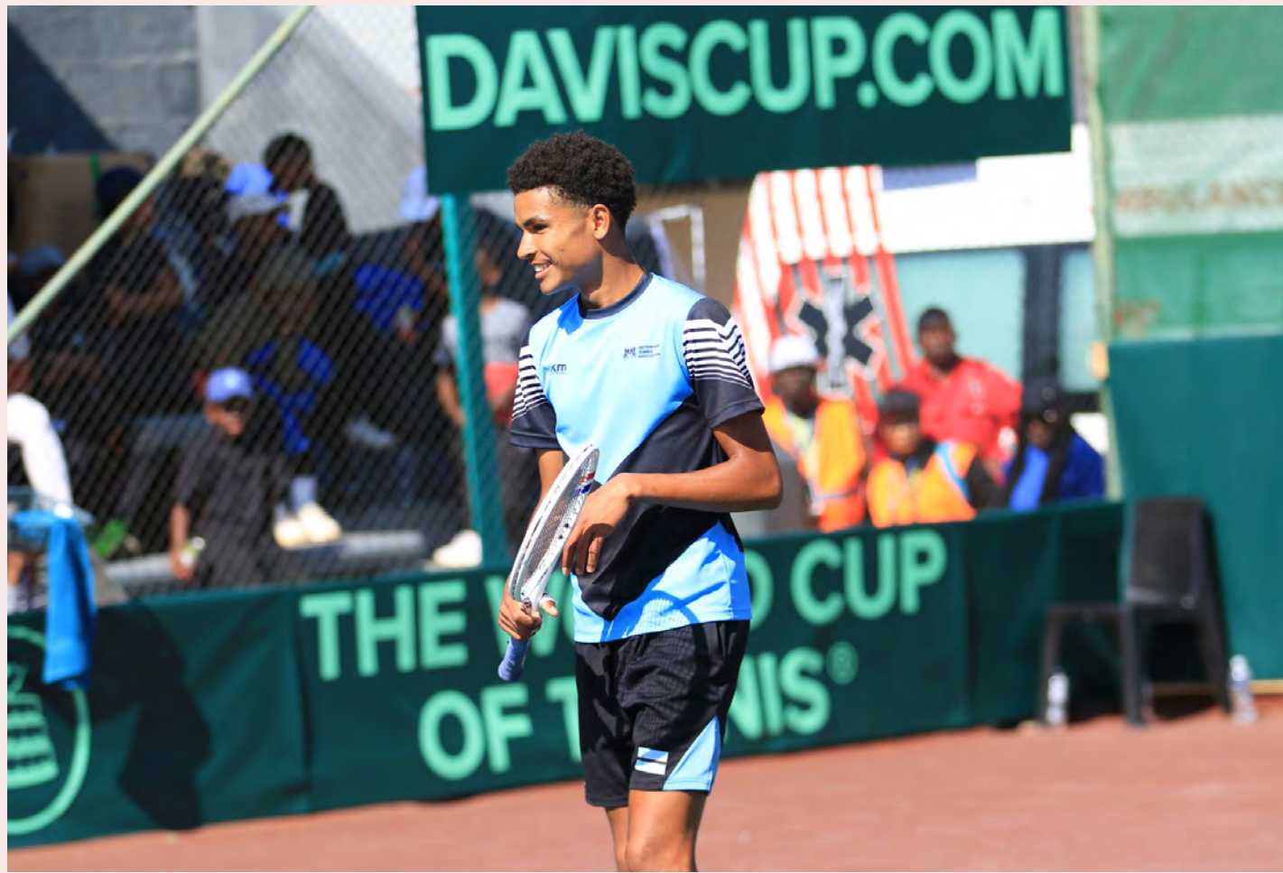
Team Botswana has been leaving no stone unturned during the group stages of the Davis Cup Group V competition held at the National Tennis Centre in Gaborone. Botswana will face Madagascar in a highly anticipated promotional playoff match which will determine who goes to Group IV in 2026. Let's all meet at the National Tennis Centre and witness our youthful team rewrite history on home soil.