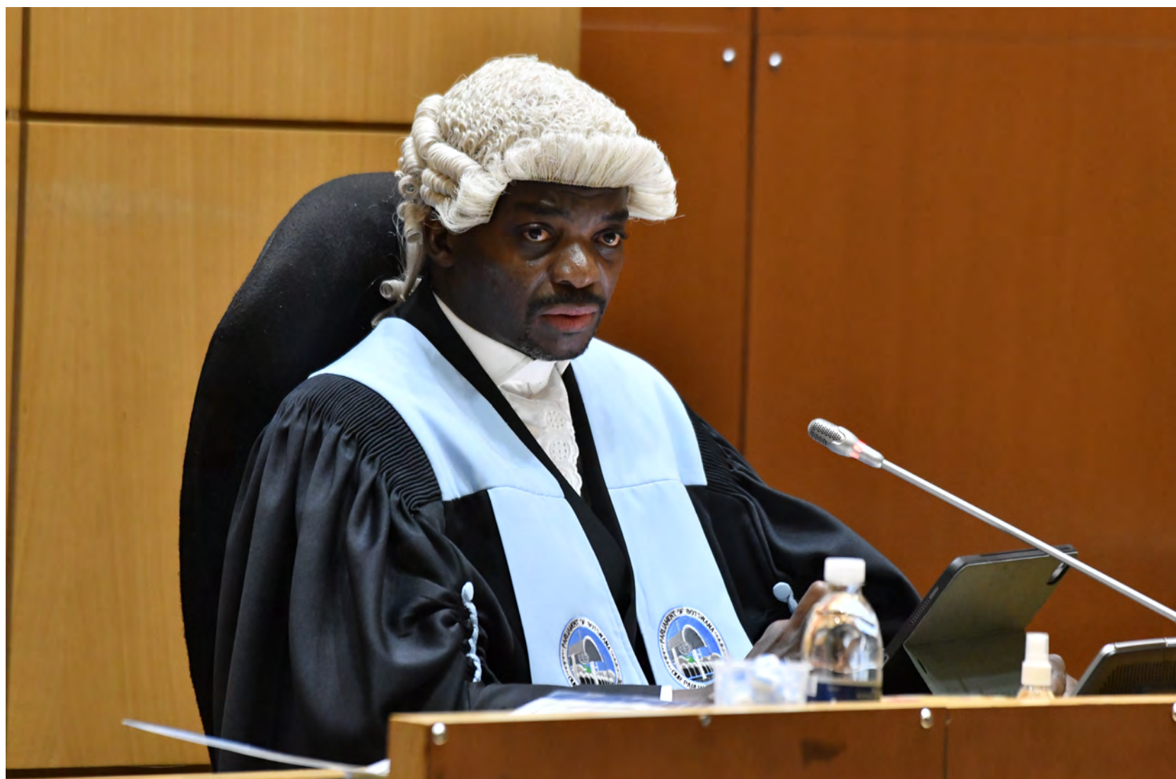
Speaker of the National Assembly, Dithapelo Keorapetse