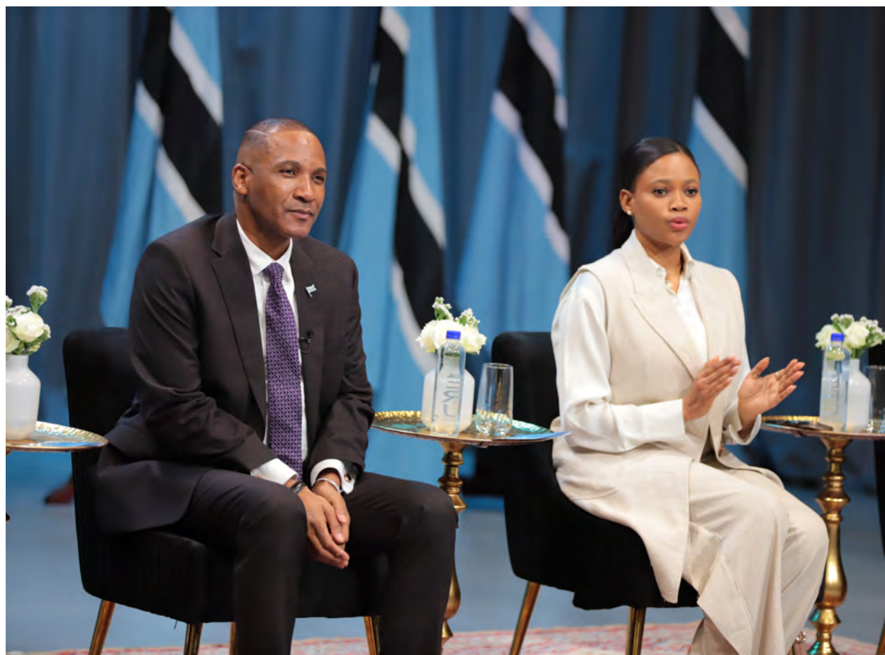
President Boko with Mineral Minister Kenewendo

While De Beers said in February that Botswana was considering increasing its stake, the comments appear to mark a shift in tone and ambition. Anglo is under pressure to complete its exit from De Beers this year as part of a restructuring promised after it last year rebuffed