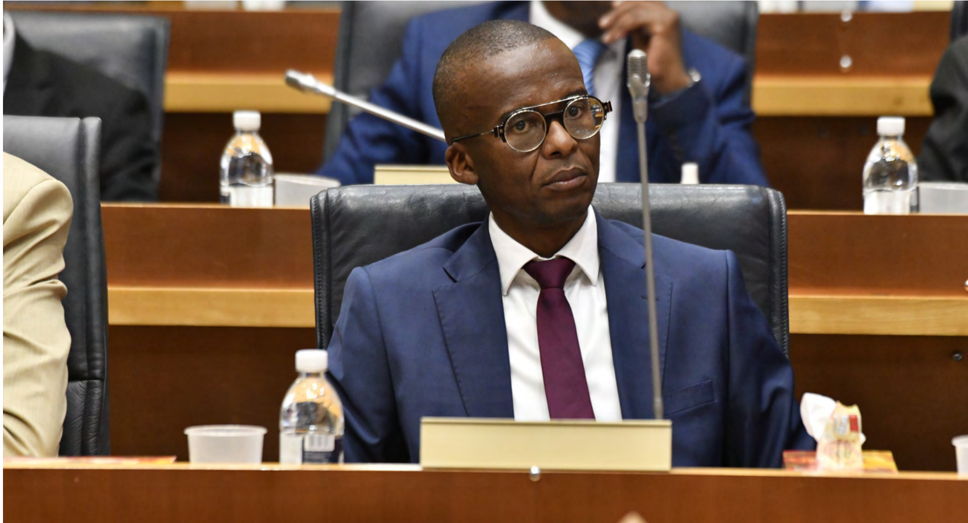
Vice President and Minister of Finance Ndaba Gaolathe

exchange reserves was as a result of the weaker global demand for the natural diamonds amongst other factors.