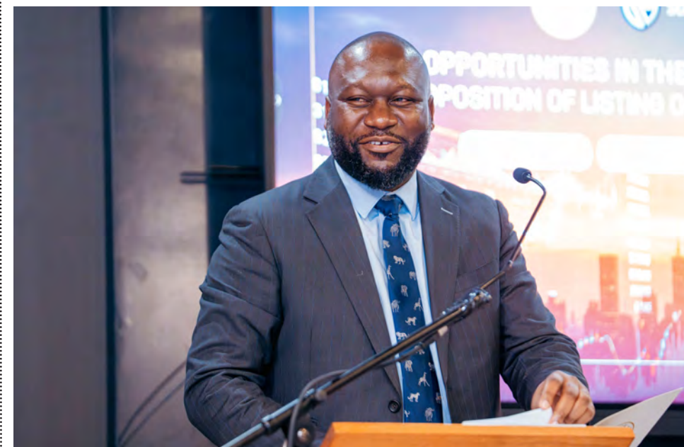
BSE CEO, Aupa Monyatsi

B OTSWANA STOCK EXCHANGE (BSE) is celebrating a robust and unprecedented performance in the first six months of 2025. The local bourse saw total trading across all listed instruments surging to P7.1 billion compared to P3.6 billion in H1 2025, a remarkable 96.9% increase.